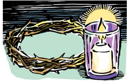
Service of Darkness